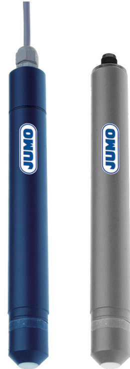
Type 202630/40... and type 202630/50...

Application areas: measurements in drinking water, swimming pool water, service water, process water, cooling water, seawater (types 202630/43 and /53).